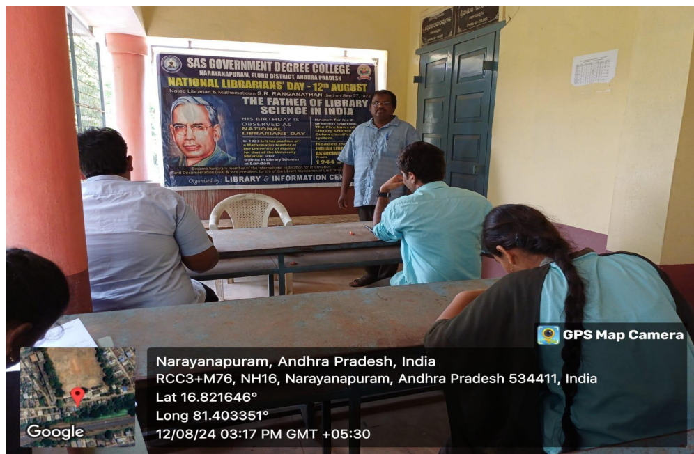
Librarian in the Library day

The event saw students engaging in discussions on the importance of utilizing library resources effectively. It reinforced the idea that libraries remain a vital tool in the academic journey, helping students explore new ideas and broaden their horizons.